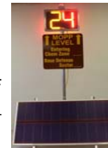
Networked UCMS systems can be customized, like this MOPP level sign.

Using state of the art microprocessor and RF devices, IST's networked products provide customers with an effective solution to more complex and wide spread control missions. Using these products puts a single operator in hundreds of locations in less time than it takes to walk out the door. Also the systems can provide field data like battery level, temperature, ambient light, signal strength, traffic conditions, speed, fault conditions and other custom inputs.