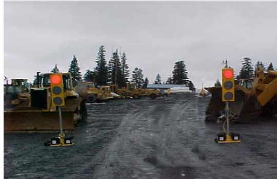
Wireless RDTL units used for Single Lane control. Units can be used in pairs or quads.

Based on specifications from the Federal Manual of Uniform Traffic Control Devices (MUTCD) , IST's Traffic Control products are effective. By moving operators out of harms way and providing them with better control and feedback, serious injuries are reduced. The public benefits from fewer accidents and less road rage by providing them with clear, concise signals that can be seen from much further away than flaggers and officers. Traffic congestion is also reduced by adaptive operations.